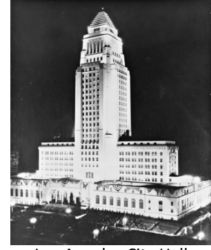
Los Angeles City Hall

The Medal of Valor was first presented to an officer in 1925.