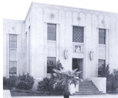
Valley Division Station

On January 1, 1924, Valley Division opened in the Van Nuys City Hall. It was the largest police division, embracing an area of over 200 miles.