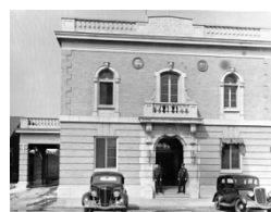
77th Street Station

77th Street Station was established in 1925. Its divisional territory was originally a part of University Division.