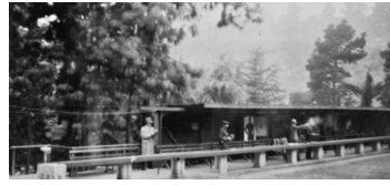
Pistol Range in Elysian Park