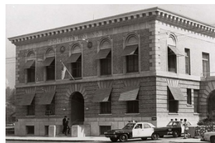
Highland Park Station - Division 11 (originally 9)

Highland Park Division was formerly known as Eagle Rock Division and was located at 2336 Colorado Blvd. The change in name came with the establishment of the station at 6045 York Blvd, which opened in April 1926.