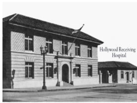
Hollywood Police Station

The Metropolitan Division was formed April 16, 1933, by combining the Reserve Unit, the Vag Squad, Intelligence Bureau and several miscellaneous details working out of the Chief's Office.