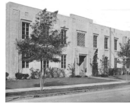
Lincoln Heights Station

The 1932 Summer Olympics was held from July 30 to August 14, 1932, in Los Angeles. The Elysian Park range was the pistol venue site for the Games.