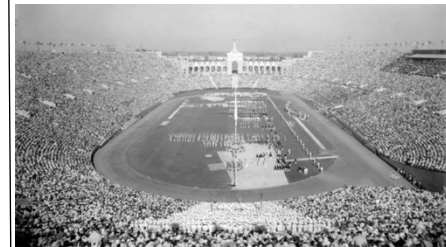
Opening Ceremony for 1932 Olympics

On December 7, 1931, the new Lincoln Heights station opened.