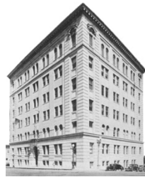
San Pedro Station

San Pedro City Hall was completed in 1928. The Police Station occupied the first floor and the Divisional Jail occupied the seventh floor.