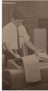
Police Student Worker

The Police Student Worker program started in February 1967 for men between the age of 18-21 and enrolled in an accredited college.