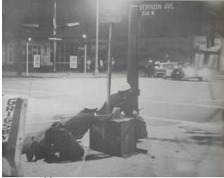
Officers taking cover during Watts Riots

One of the most violent social upheavals to confront the Los Angeles Police Department occurred in August 1965. For seven days, the Los Angeles community of Watts was engulfed in rioting and looting. With the help of other law enforcement agencies and the California National Guard, rioting and looting were brought to a halt. In the end, 34 people were killed, 1,032 were injured, 3,952 were arrested, and 600 buildings were damaged or destroyed.