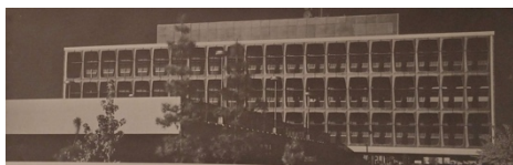
Valley Police Headquarters

Behavioral Science Services came about in 1968.