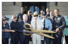
Ribbon cutting at Los Angeles Police Museum

A ribbon cutting ceremony for the new Los Angeles Police Museum located in the former Highland Park Police Station was held on June 28, 2001.