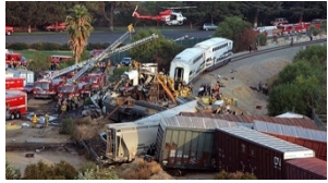
Metrolink Train Collision

In 2009, LAPD's Polygraph Unit was the first state and local law enforcement agency in California to have successfully completed the accreditation process through Polygraph Law Enforcement Accreditation.