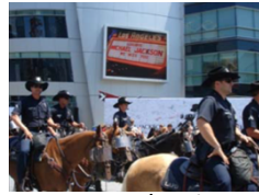
Mounted Unit at Michael Jackson's Memorial Ceremony at Staples Center