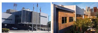
OVB & VTD

In 2009, the new facility for Department Operations Center (DOC) opened. The facility was designed to withstand a magnitude 8.0 earthquake and features blast-resistant exterior surfaces.