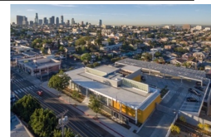
Metro Division Facility