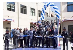
Elysian Park Academy Grand Re-Opening