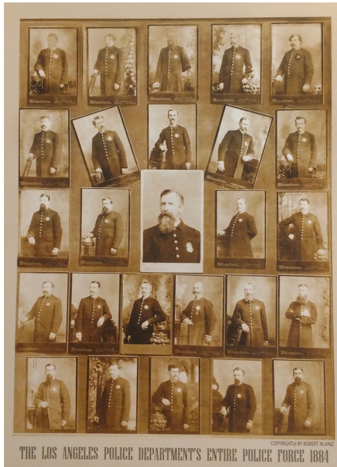
The Los Angeles Police Department's Entire Police Force 1884

By 1885, the Department increased to 18 men. It's inventory of equipment was valued at $354 and included a horse and saddle, six dark lanterns, thirteen police stars, twenty rogues' pictures, and seven sets of "nippers."