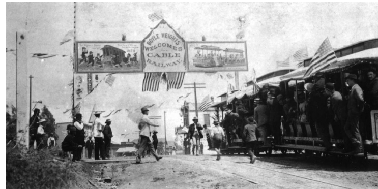
View of the inauguration of cable railway in Boyle Heights which became Los Angeles' first streetcar suburb in 1889

Los Angeles acquired its first patrol wagon in 1888. That first vehicle was about 12 feet long, with two seats along the sides, uncovered and drawn by one horse.