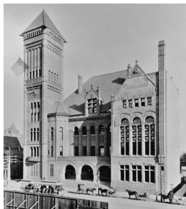
City Hall, built in 1888

"New" City Hall, built in 1888 at Second and Broadway, stood until 1927.