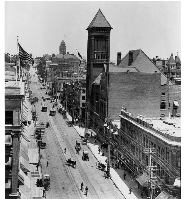
Looking north on Broadway from near 3rd Street showing streetcars, horse-drawn wagons, bicycles and pedestrians all sharing the roadway. City Hall stands tall on the east side of Broadway.

The population of Los Angeles reached more than 100,000 with the 1900 census.