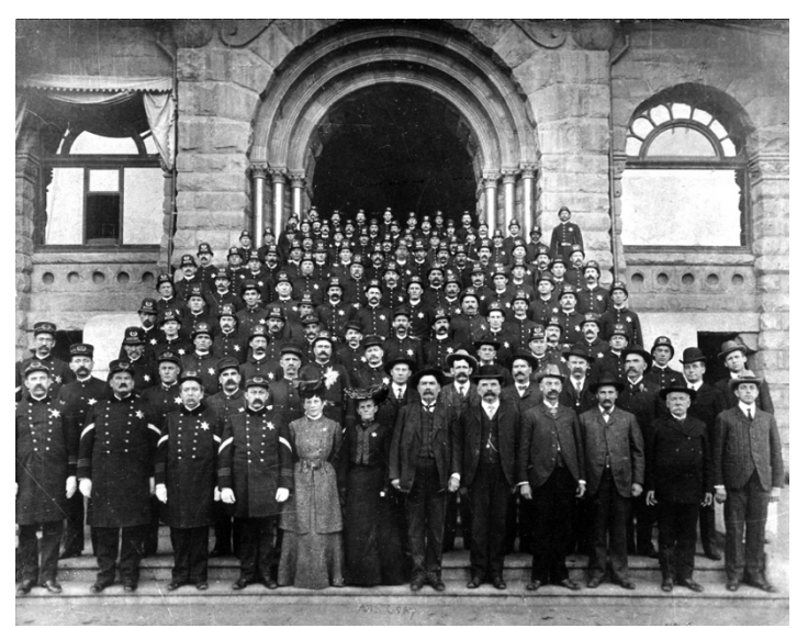
The entire Los Angeles Police Department

LAPD has used specially trained Juvenile Officers since 1903. Because the attitudes that lead to criminal behavior are often formed in youth, this activity is perhaps the most important crime prevention function of the Department.