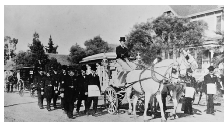
Captain Auble's funeral procession, 1908

Using access to water as a bargaining tool, the City of Los Angeles manages to annex a shoestring strip of land extending south to San Pedro in 1906.