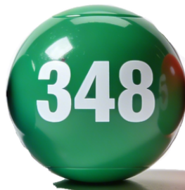
Income & Expense Reports submitted