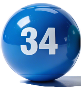
Senior Bingo Licenses Issued

During the 2025 reporting period, CSS monitored Senior Bingo operations across multiple locations throughout the City of Los Angeles. The following data reflects regulatory activity and participation levels reported by authorized senior centers: