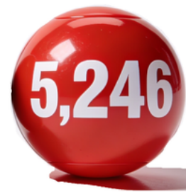
Estimated Annual Participation