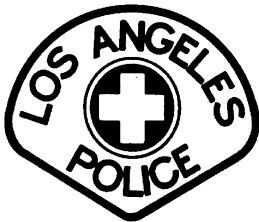
BLUE LETTERING, SILVER CROSS ON GREEN FIELD, BLUE PIPING - POLICE OFFICER, SILVER PIPING - SERGEANT AND ABOVE

635.30 TRAFFIC ENFORCEMENT EMBLEM. Officers who have successfully completed the Basic Motorcycle Officer Riding School and who are assigned to a two-wheel traffic enforcement detail shall wear the Traffic Enforcement Emblem.