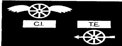
( \frac{1}{4} INCH BELOW SHOULDER EMBLEM) SILVER.

635.70 AIR SUPPORT DIVISION EMBLEM. Officers assigned to Air Support Division shall wear the appropriate emblem(s).